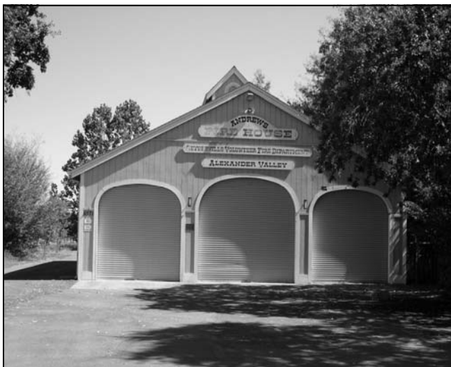
Volunteers Needed at Station 2 (Pictured Above)

tion about becoming a volunteer firefighter. Please help us prevent higher taxes and fire insurance premiums. Become a Volunteer Firefighter today!