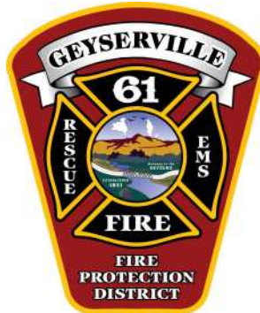
New Uniform Patch