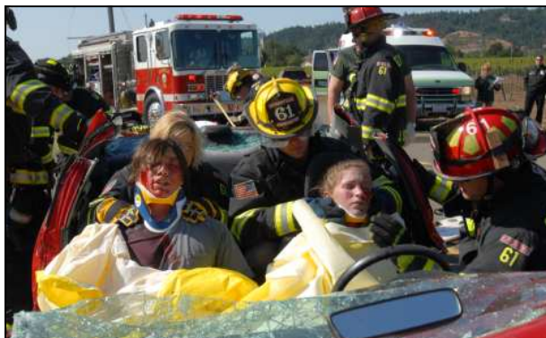
Geyserville firefighters treat the "injured" students after using the jaws of life to remove the top of the car.

one was paralyzed and one victim succumbed to injuries sustained at Healdsburg General Hospital. All the students in the reenactment were (continued on page 2)