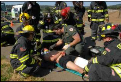
Geyserville Firefighters treat an “injured” student.

The next day the regular school assembly was changed into a funeral for the deceased student of the crash. Participating students and parents spoke openly about their feelings of the impact of the acted event. Many guest speakers addressed all the students about how alcohol and related vehicle accidents had affected them. To watch the “Geyserville Every 15 Minutes” video or to see more photos from the event please check our website: www.geyservillefire.com