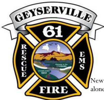
New “Stand alone” logo