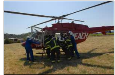
Geyserville Firefighters load an “injured” student into a helicopter

CHP tested and arrested the suspected DUI driver. Who was booked into Sonoma County Jail, and later arraigned in Sonoma County Superior Court. All the participating students were taken to an overnight retreat where they discussed their feelings about the day’s events. Councilors and guest speakers discussed the effects of alcohol abuse with the students. The student’s parents, separately, had an open discussion over dinner the night of the retreat. The parents were included in the talks about alcohol abuse and its effects on families. The retreat was ended by the parents writing emotionally charged good-bye letters to their siblings.