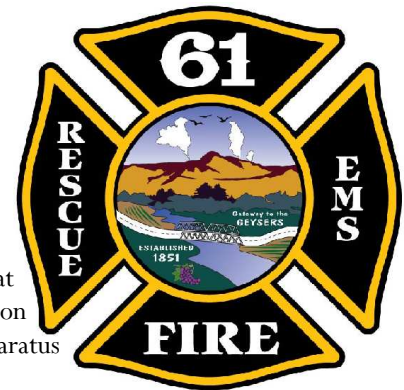
Logo that appears on the Apparatus

On July 1, 2008 the Geyserville Fire Department unveiled its new logos and patch. The logos and patch were designed by a special committee appointed by the Fire Chief. The new logo is a mixture of the old design within a Maltese Cross with the number 61 representing the department’s number, the words Rescue, Fire and EMS representing what we do.