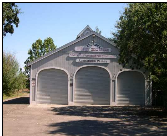
Volunteers Needed at Station 2 (Pictured Above)

higher taxes and fire insurance premiums. Become a Volunteer Firefighter today!